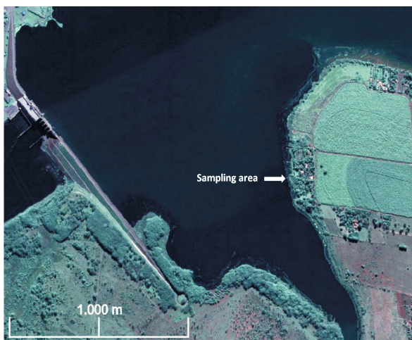
Figure 3. Detail of the sampling area at the Nova Avanhandava Reservoir, Municipality of Buritama, São Paulo State, Brazil.