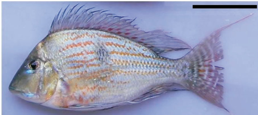
Figure 1. Specimen of Geophagus proximus from Nova Avanhandava Reservoir, Municipality of Buritama, São Paulo State, Brazil. Scale bar = 40 mm.