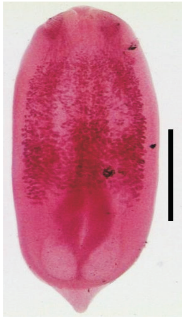
Figure 4. Austrodiplostomum compactum metacercariae collected in the humor vitreous of Geophagus proximus from Nova Avanhandava Reservoir, municipality of Buritama, São Paulo State, Brazil. Scale bar = 500 \mu m.